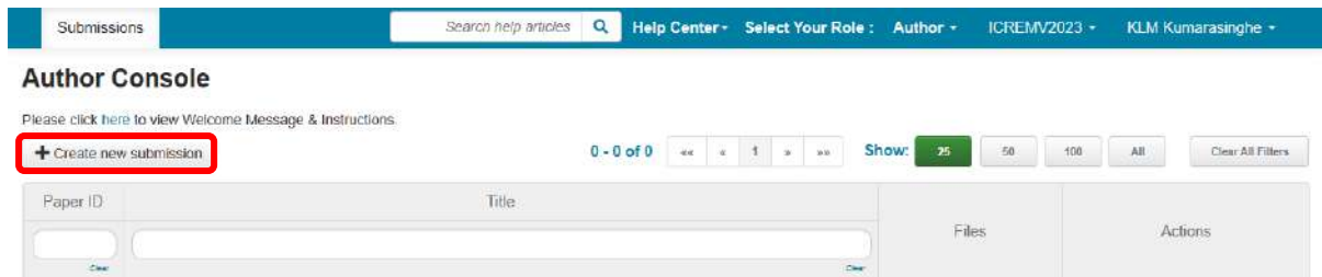
Figure 5. Adding New Submission