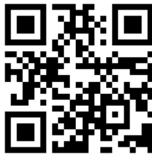
Figure 1. Registration Link QR Code